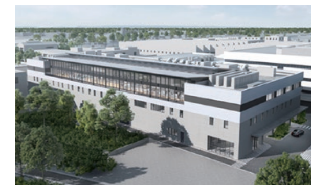
Exterior of new research facility

By locating the facility adjacent to the Environment and Mobility Development Center and the Advanced Composites Center, both of which engage in mobility-related development and evaluations, the Company is also expecting to generate synergies while promoting integrated R&D and digital solutions proposals. Toray will reinforce open innovation internally and externally by creating an open laboratory for cocreation with customers and academia while deploying a framework to deepen communication among researchers and encourage ideas to emerge.