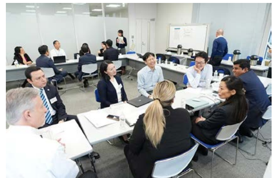
The Global Legal & Compliance Meeting being held in person for the first time in four years

The Legal & Compliance Division at Toray Industries held an in-person Global Legal & Compliance Meeting for the first time in four years. Toray Group legal and compliance officers from various companies and regions gathered to discuss challenges and share solutions pertaining to legal and compliance activities.