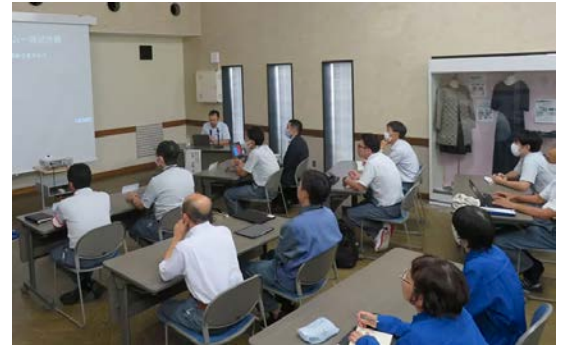
Ethics training concerning medical devices

At the Toray Industries Seta Plant, an ethics training session was conducted for all employees involved in medical device quality assurance, technology, and production. The session featured a clinical technician who works with the SATAKE HotBalloon™ ablation catheter. Delivered from the perspective of a medical professional, the training explained how the Toray product is used in medical settings and what potential health risks product defects could pose.