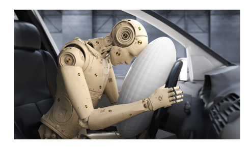
Helping to keep people safe Toray helps protect people from infectious diseases, accidents, disasters, and extreme weather events such as heatwaves.