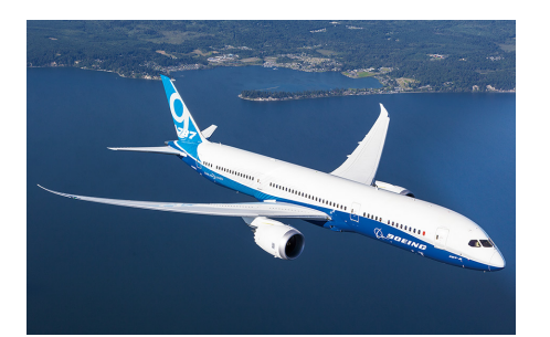
Curbing CO<sub>2</sub> emissions throughout the life cycle of products

Toray provides lightweight and strong carbon fiber that can reduce the weight of aircraft and automobiles, to improve fuel economy and reduce CO<sub>2</sub> emissions.