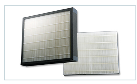
Providing ultrafine filter fibers for cleaner air Toray supplies proprietary ultrafine fiber non-woven fabrics that remove particulates from the air, delivering cleaner air around the world.

Toray supplies water treatment technologies for the desalination, purification, and reuse of water to address water scarcity and reduce environmental impacts.