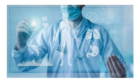
Improving the quality of medical care with innovative technologies and advanced materials

Toray helps improve the quality of medical care with early diagnosis of diseases and innovative drugs and devices.