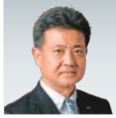
Senior Vice President (Member of the Board)