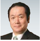
Senior Vice President (Member of the Board)