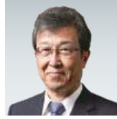
Senior Vice President (Member of the Board)