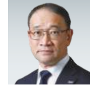
Vice President (Member of the Board)