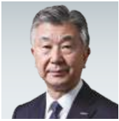
Vice President (Member of the Board)