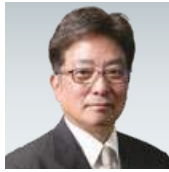
Vice President (Member of the Board)