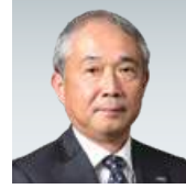
Senior Vice President (Member of the Board)