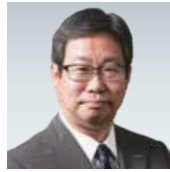
Vice President (Member of the Board)