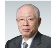
Outside Director Ryoji Noyori