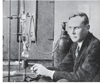
Wallace H. Carothers, inventor of nylon

to nylon were sensational in themselves—made from “coal, water, and air,” the fiber was “as strong as steel, as fine as the spider’s web.” Marking the true dawn of the synthetic fiber age, nylon came as a shock to not only Toray’s leadership, who had envisaged rayon fiber at the forefront of a new age, but