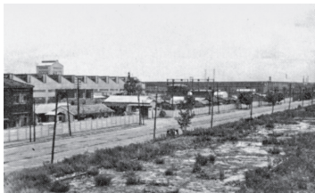
Nagoya Plant (1951)

In May 1950, as a site for a caprolactam (nylon 6 raw material) and polymerization plant, Toray purchased part of the former premises of the Oye Plant of Mitsubishi Heavy Industries, Ltd., which was close to Toagosei Chemical Industry Co., Ltd., a supplier of raw materials such as cyclohexane, ammonia, and sulfuric acid. It was designated the Toray Nagoya Plant. In July, ground purification ceremonies were held for both Nagoya and Aichi plants and construction got underway. Aichi Plant spinning facilities were completed in February 1951 and the first nylon filament was produced. The Nagoya Plant followed suit, commencing nylon staple fiber production in December.