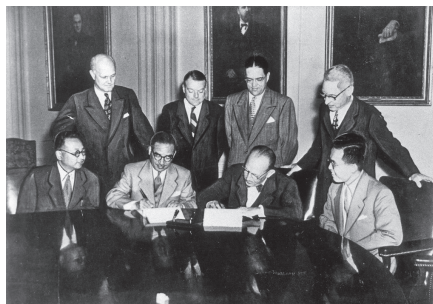
Signing of the patent licensing agreement with DuPont (June 1951)

infringe on patents owned by DuPont. Amilan was indeed nylon 6 and even though the manufacturing process and substances differed from the nylon 66 produced by DuPont, there was potential for infringement if peripheral patents relating