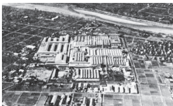
A bird's-eye view of Aichi Plant (1952)