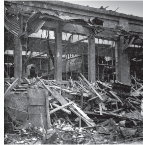
Shiga Plant damaged by bombing (July 1945)

Aichi Plant. But in December of that year, all machinery and equipment were requisitioned by the government. In the context of the Pacific War, Toray was not a supplier of munitions and was therefore forced to relinquish its equipment as a source of steel. To be able to maintain a certain amount of equipment, Toray inevitably had to produce items for military use.