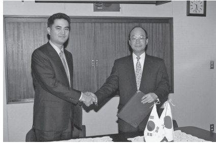
Signing ceremony for joint venture between Toray and Saehan Industries (June 1999)

In 1995 in Korea, prior to the establishment of TSI, Toray and the Samsung Group had also established STEMCO, Ltd. for forming flexible electronic circuits and leads on polyimide (PI) film, and STECO, Ltd. for mounting driver ICs. With strong growth in these businesses, STECO was relocated to a new plant in Cheonan in 2003, followed by STEMCO relocating to Ochang in 2005. While having STECO as its largest customer, STEMCO also supplied products to other semiconductor companies and grew to become the manufacturer with the leading share of the global market.