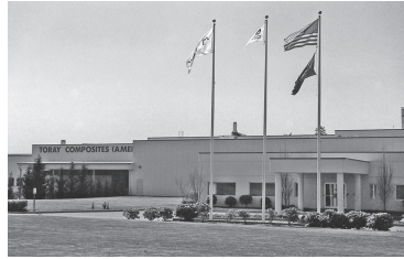
TCA (now CMA) (United States)

In 2002, Toray reformed its businesses in every sector through implementation of its NT21 companywide mid-term management program. At the same time, it continued strengthening its globalization plans. It also introduced a regional supervisory organization system to enable decisions to be made quickly and autonomously, and to take advantage of the high rates of economic growth in some regions to expand its own businesses.