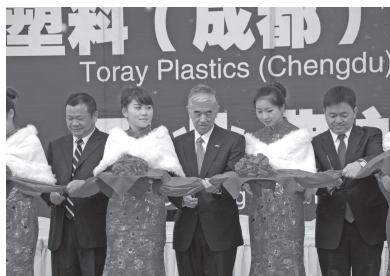
TPCD opening ceremony (December 2013)

Resins Business: In 2010, Toray restructured Toray Plastics (China) Co., Ltd. (TPCH, renamed from TPHK) to become its resins business headquarters for the whole of China. While strengthening its unified production and sales operations, it established a new plastics technology center at TPSZ in Shenzhen to centralize its development and technical services. In 2012, Toray established Toray Plastics (Chengdu) Co., Ltd. (TPCD) in Chengdu, Sichuan Province, to make inroads into inland China. Then in 2013, it installed compounding equipment for Torayca resin at TPSZ.