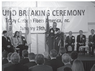
Ground breaking ceremony for South Carolina plant of CFA (now CMA) (January 2016)