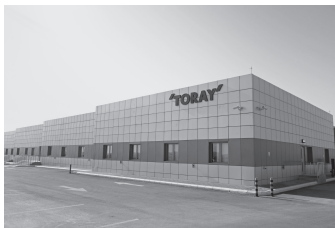
TMME (Saudi Arabia)

While expanding its business in China, Toray established Toray Membrane USA, Inc. (TMUS) in the U.S. in 2006, and Toray Membrane Middle East LLC (TMME) in Saudi Arabia in 2014 through a joint venture, and started production of reverse osmosis (RO) membrane elements. Having also acquired TCK in 2014, the Toray Group had five